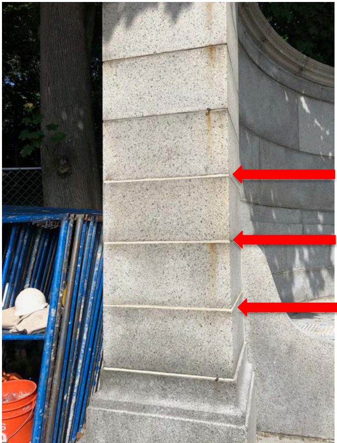
Figure 1: Three mortar samples installed.

Building Conservation Associates, Inc. Lisa Harrington Senior Architectural Conservator