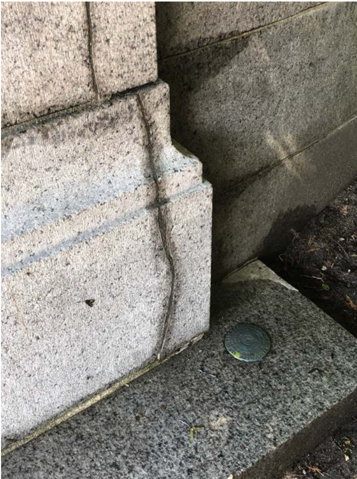
Figure 3: Crack repair mock-up, not yet dried for approval.