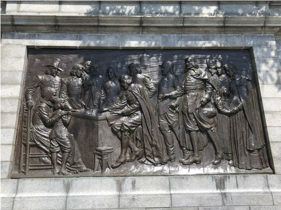
Figure 8: Bronze relief following conservation completion.