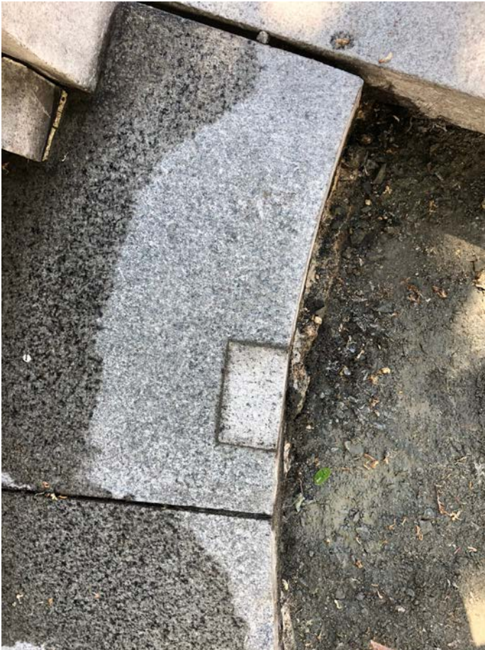
Figure 5: Dutchman installation, approval pending.