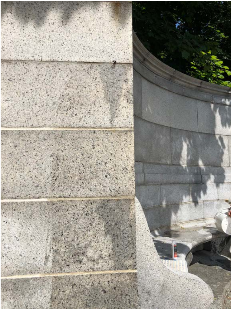
Figure 7: Rust stain removed with Artisan Heavy Duty Rust Remover.