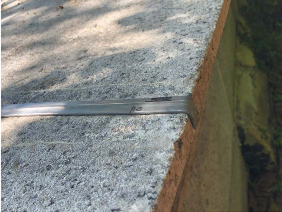
Figure 4: Lead "T" joint cover mock-up, approved.