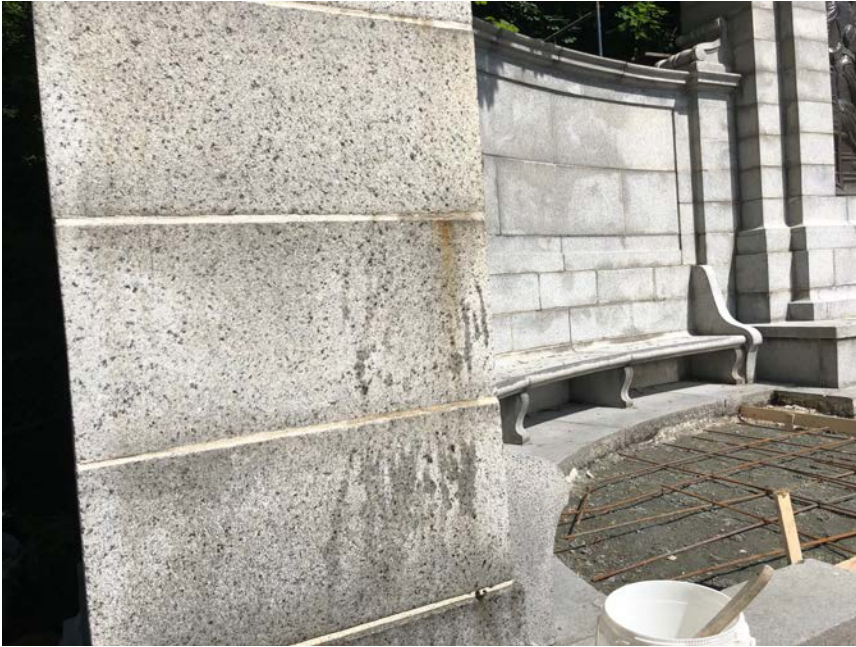
Figure 6: Rust stain, prior to removal testing.